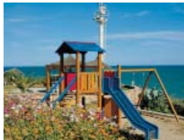
* with HR High Resolution

• QT-890/WDR includes HR High Resolution . Get over your image details and features, under unstable or variable lighting conditions, even in zooming events.