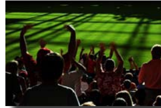
* No WDR

You can get the highlights and shadow details (also in backlight images)