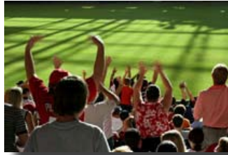
* with WDR